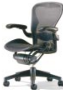
Aeron Work Chair

Herman Miller builds the Aeron chair responsibly, conscious of its environmental impact. Many of its parts are made from recycled materials, including the base, which is recycled aluminum, and the frame, made from recycled polymer.